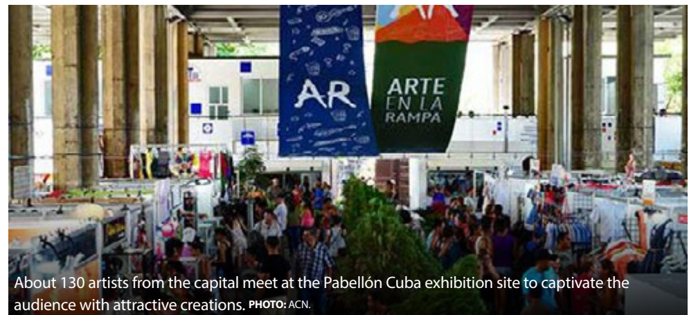
About 130 artists from the capital meet at the Pabellón Cuba exhibition site to captivate the audience with attractive creations.

Several musical bands are expected to perform on August 13, such as Karamba, Síntesis and Interactivo, as part of a tribute to Commander in Chief Fidel Castro on the anniversary of his birth.