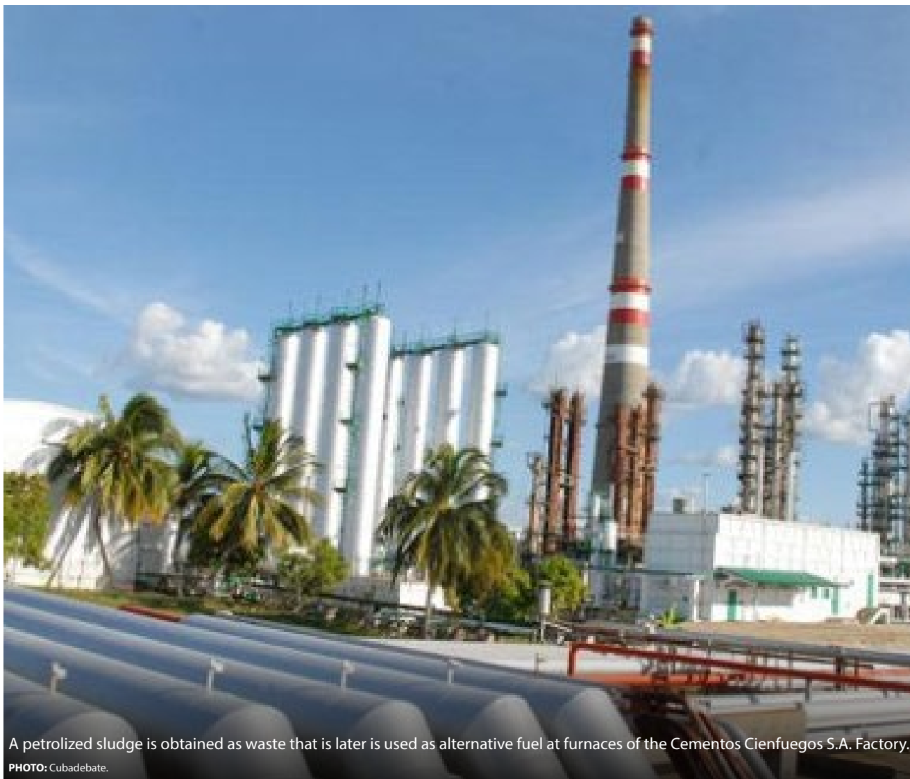
A petrolized sludge is obtained as waste that is later is used as alternative fuel at furnaces of the Cementos Cienfuegos S.A. Factory.

In 1992, Cuba signed the Basel Convention, whose objective is to reduce the levels of waste exchanges to protect human health and the environment through a dangerous waste movement control system. With these actions the Cienfuegos Refinery has taken, the convention is ratified and imports are substituted.