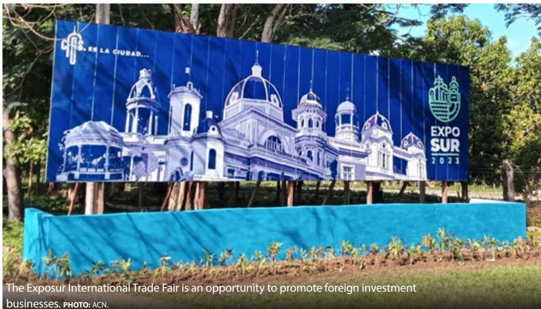
The Exposur International Trade Fair is an opportunity to promote foreign investment businesses.

The Exposur 2023 International Trade Fair will include the attendance of businesspersons from Mexico, Egypt, India, France, Ecuador, Canada and other nations.