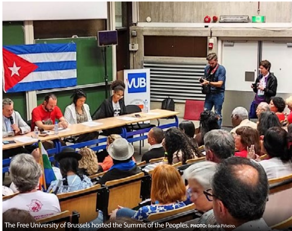
The Free University of Brussels hosted the Summit of the Peoples.

In his speech at the event, Cuban President Miguel Díaz-Canel was grateful for the rejection to the blockade and to the inclusion of Cuba, once again, on the list of sponsors of terrorism which he denounced as fraudulent and unilateral.