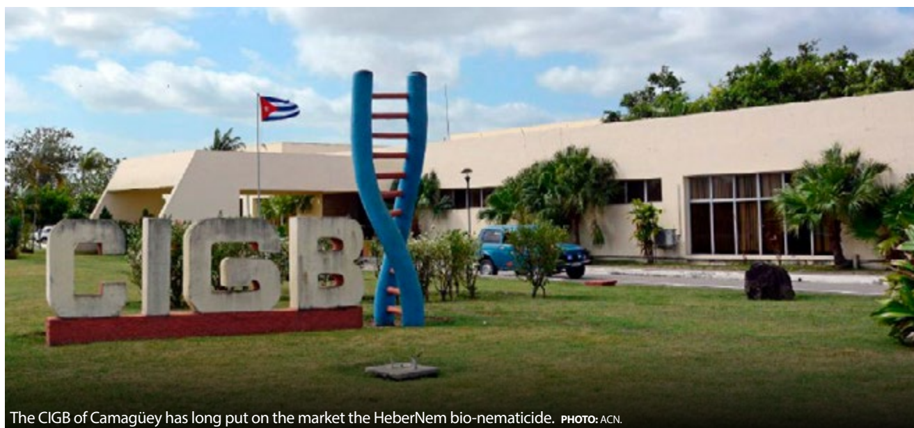
The CIGB of Camagüey has long put on the market the HeberNem bio-nematicide.

In spite of this panorama, which also includes energy problems, the executive assured that solutions are being sought and "we have photovoltaic panel projects with strategies to reverse the electro-energy matrix" as well as studies on the potential of the roofs of our institutions and to cover this energy demand," he concluded..