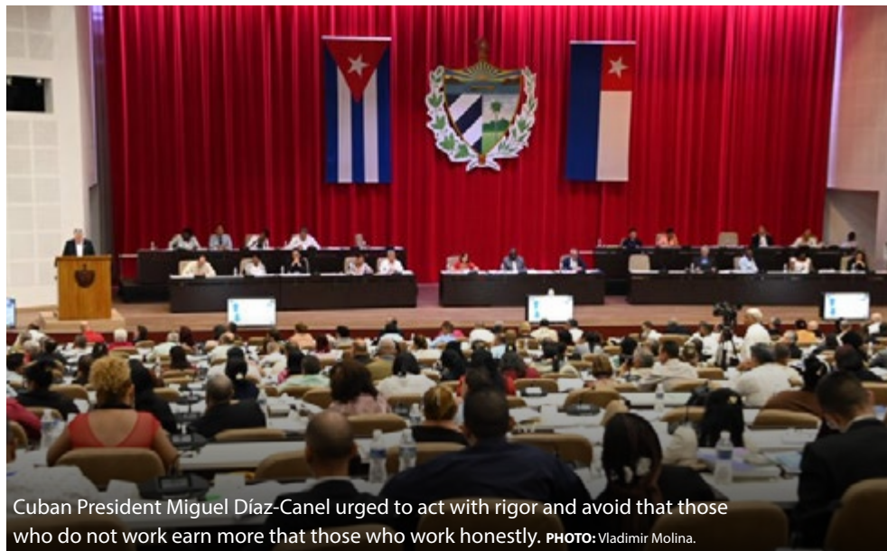
Cuban President Miguel Díaz-Canel urged to act with rigor and avoid that those who do not work earn more than those who work honestly.