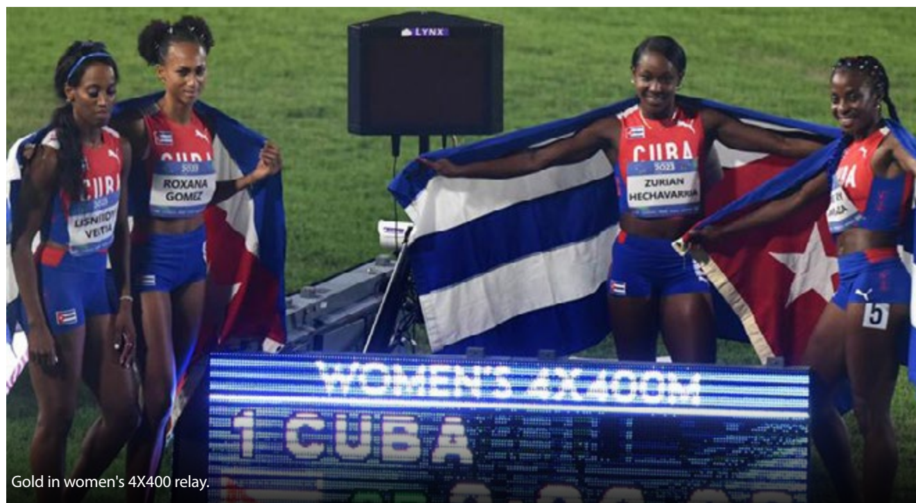
Gold in women's 4X400 relay.

After the performance attained in this event, the Cuban representatives already plan their course to the Pan-American Games, "without conformism, always looking forward to higher goals and loyal to dignity, the most valuable medals," the statement indicated.