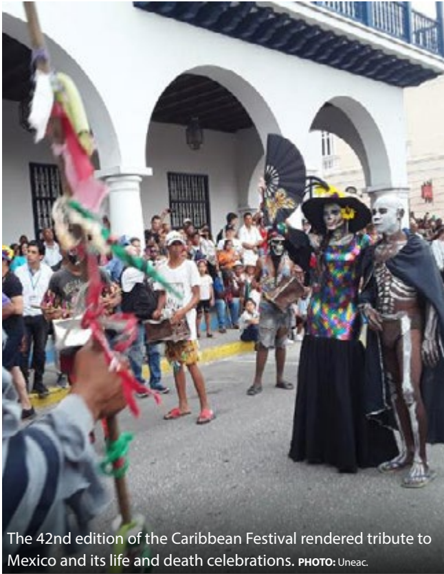
The 42nd edition of the Caribbean Festival rendered tribute to Mexico and its life and death celebrations.

SANTIAGO DE CUBA.- The Caribbean Festival, held in this eastern Cuban city, radiated a wide range of regional folklore activities that included poetry, troubadour music and lyric art, among other artistic expressions.