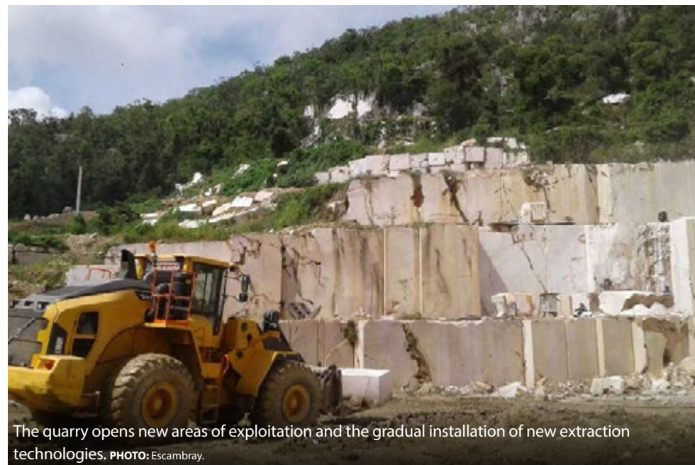
The quarry opens new areas of exploitation and the gradual installation of new extraction technologies.

The Cariblanca marble mountain is located in one of the most beautiful inter-mountainous valleys of this central Cuban region and has reserves to continue benefiting the development of this community, with an important contribution to Old Havana restoration.