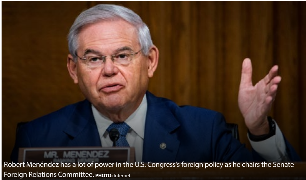
Robert Menéndez has a lot of power in the U.S. Congress's foreign policy as he chairs the Senate Foreign Relations Committee.

In 2015, the embassies were reopened in Washington and Havana; over twenty favorable agreements were signed, and respect prevailed, from both sides, in spite of differences. The parties were then able to talk. Biden, apparently, turned the page on what Obama had made at the White House and has maintained, until now, the essence of the line Trump designed, which included the adoption of 243 restrictive measures against the Cuban people, many of them amidst a pandemic that brought the world to a standstill and worsen the crisis.