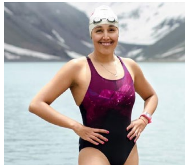
The athlete specialized in extreme swimming, in places with temperatures under five degrees and also in long distances.

A graduate of psychology at the Universidad de Chile, she admits that this discipline helps "getting adapted to complex or extreme conditions, which in addition to sport, allows us to overcome difficulties, work tolerance on frustration, pain and get in contact with nature as the main purpose."