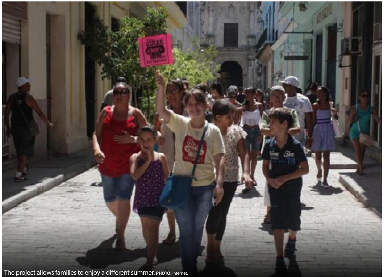
The project allows families to enjoy a different summer.

La Quinta de los Molinos, an emblematic Havana site surrounded by a rich nature and located in the heart of the city, welcomes children and seniors every week as part of a proposal called Aprendiendo sobre la fauna (Learning about the fauna).