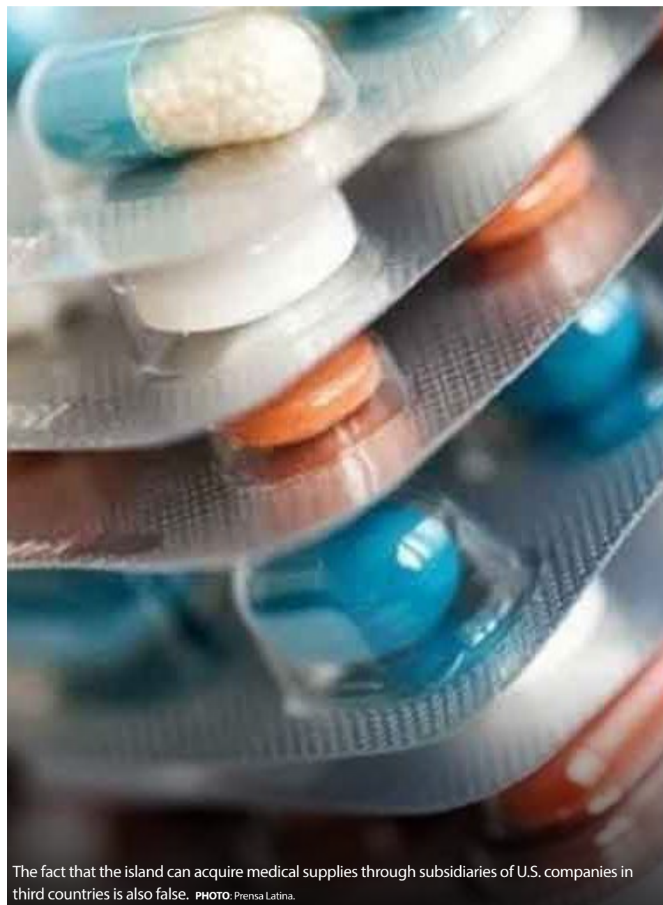
The fact that the island can acquire medical supplies through subsidiaries of U.S. companies in third countries is also false.

Rodríguez added that ships involved in the transfer of authorized medication or medical supplies can enter Cuban ports as long as they have not carried cargo or persons to or from Cuba without license and do not carry non-authorized goods.