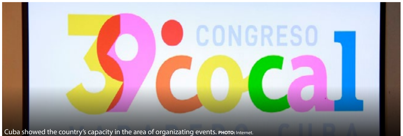
Cuba showed the country's capacity in the area of organizing events.

Cuba is a COCAL member nation since 1980 and its objective is to grow within the event industry and contribute to the national tourist growth, an important source for economic development.