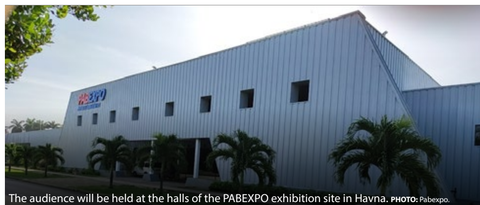
The audience will be held at the halls of the PABEXPO exhibition site in Havana.

He also appreciated the attendance of top officials from the embassies of the Russian Federation, Belarus, Argentina and Vietnam, because of the contribution they