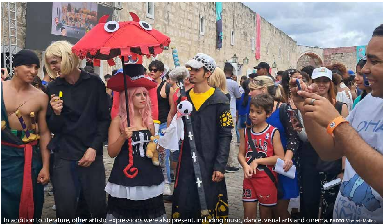
In addition to literature, other artistic expressions were also present, including music, dance, visual arts and cinema.

The main activity of this fair was the launch of the Biblioteca del Pueblo, a collection of 82 volumes that gathers the best works of the Cuban and universal literature. The theoretical program included spaces such as the Professional Book Hall, with the holding of the National Bookseller Workshop; the Editors and Literary Translators Meeting, and the Public Policies in Favor of Reading meeting, in addition to the Ibero-American Young Writers and Poetry Promoters meetings.