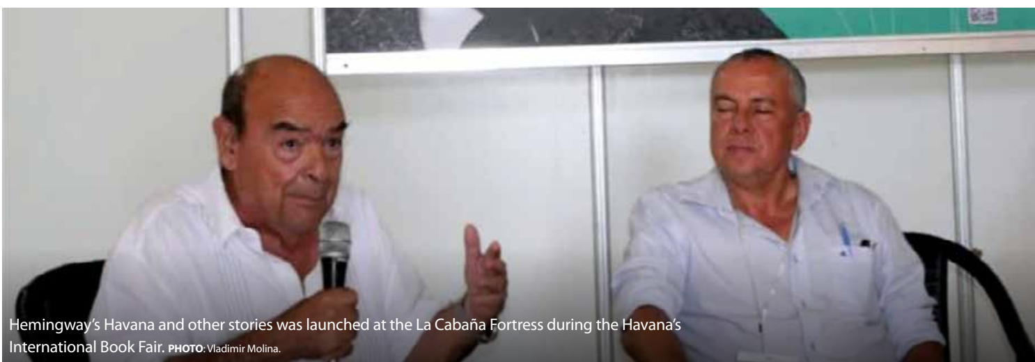
Hemingway's Havana and other stories was launched at the La Cabaña Fortress during the Havana's International Book Fair.

After the launch at the La Cabaña Fortress, the journalist signed several copies and stated his desire to continue publishing books on lesser-known events that happened in Havana.