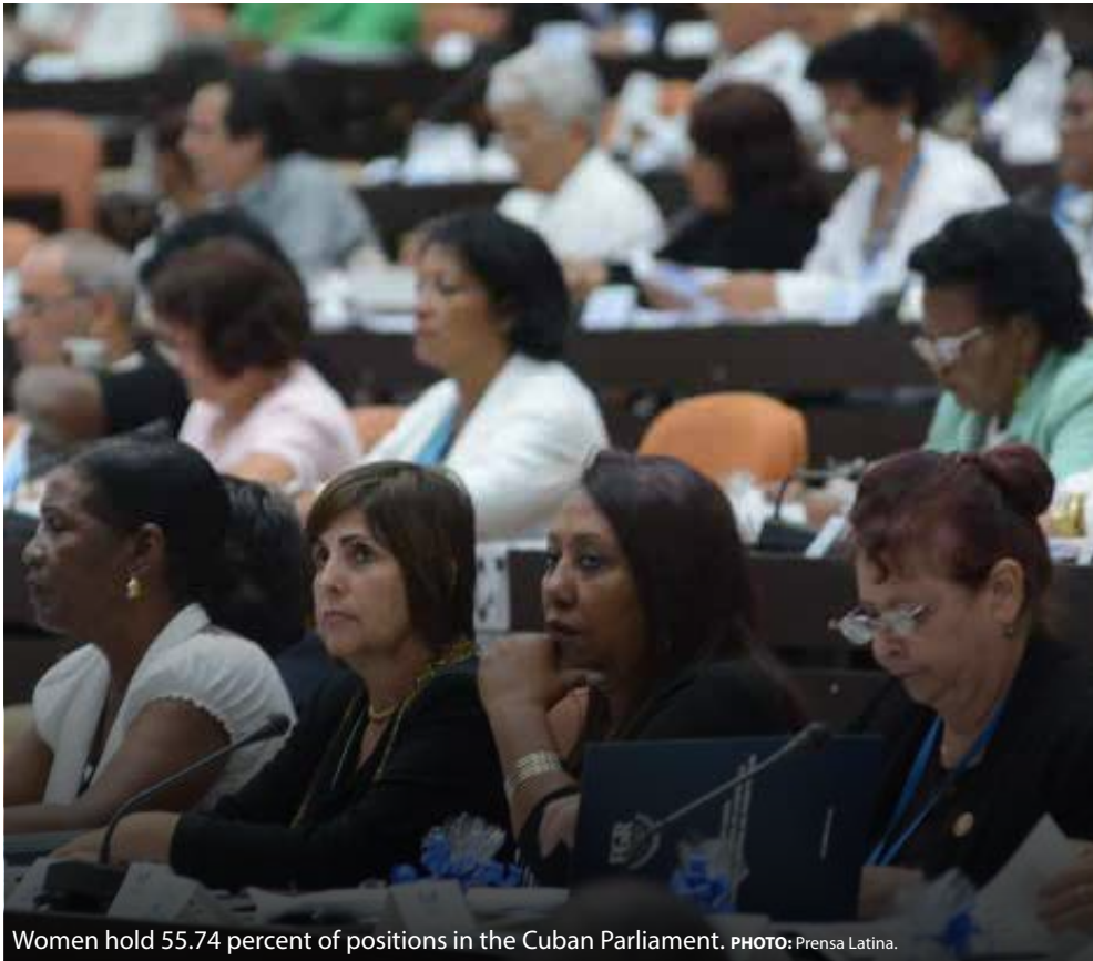
Women hold 55.74 percent of positions in the Cuban Parliament.