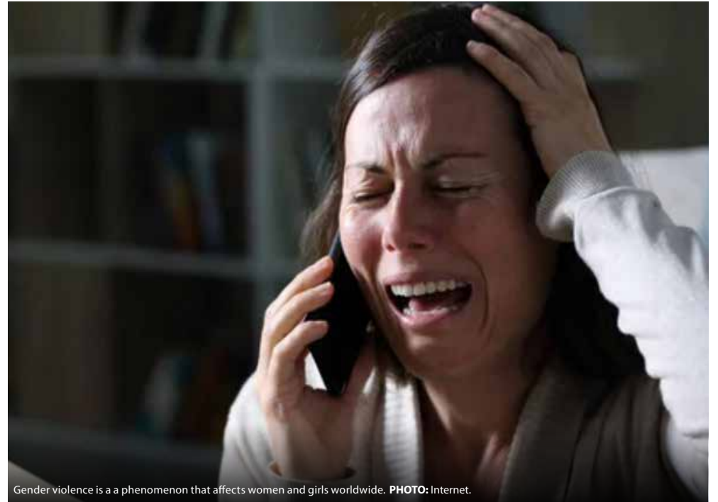
Gender violence is a phenomenon that affects women and girls worldwide.