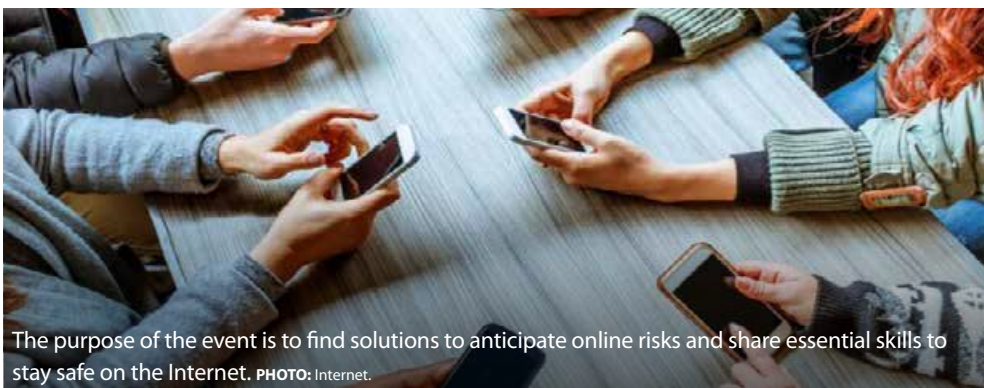
The purpose of the event is to find solutions to anticipate online risks and share essential skills to stay safe on the Internet.

Other topics will deal with networking and speed partnership to promote and foster the implementation of youth-led projects and activities in the exhibition space; empowerment from the economic aspects of ICTs, and digital transformation: innovative business models.