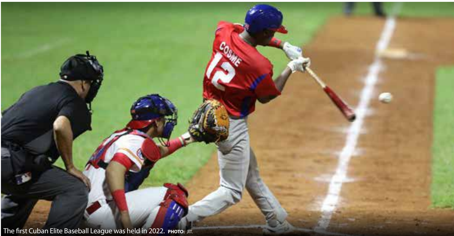
The first Cuban Elite Baseball League was held in 2022.

As of March 15, the "Play Ball" will be called out and there will be more elements to make predictions.