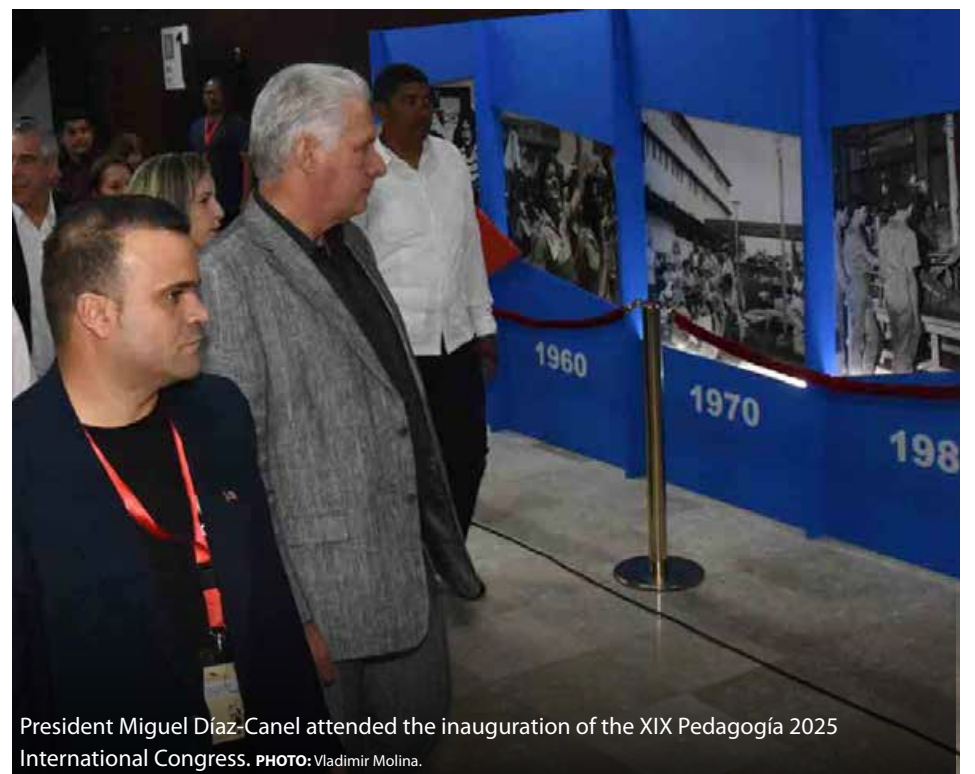
President Miguel Díaz-Canel attended the inauguration of the XIX Pedagogía 2025 International Congress.

A meeting of the Confederation of Latin American Educators executives and the I Forum of Cuban Teachers leaving abroad were also held as part of the congress.