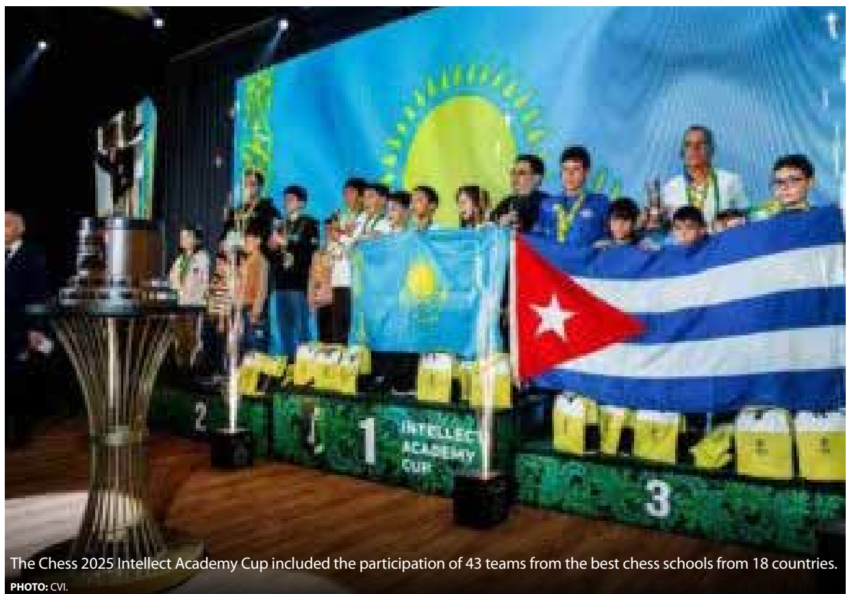
The Chess 2025 Intellect Academy Cup included the participation of 43 teams from the best chess schools from 18 countries.

Chess is more than a game; it is a thought school, a meeting space between generations and cultures. It teaches us discipline, patience and the importance of strategy, values that show the spirit of brotherhood and cooperation between our peoples, Rivero stressed.