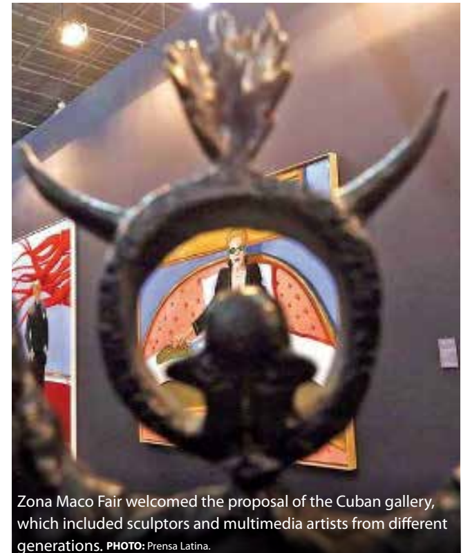
Zona Maco Fair welcomed the proposal of the Cuban gallery, which included sculptors and multimedia artists from different generations.

According to the Mexican Culture Secretariat, the initiative emerges as an inclusive space of visibility and dialogue that fosters talk between famous figures and younger voices, particularly from Latin America.