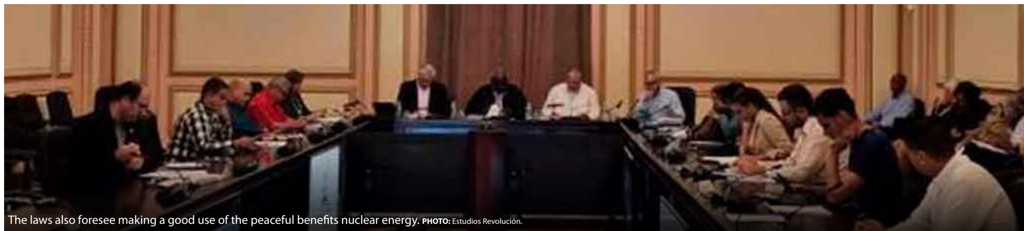
The laws also foresee making a good use of the peaceful benefits nuclear energy.

President of the National Assembly of Peoples' Power (Cuban parliament) and member of the Council of State, Esteban Lazo, stated on the topic that legal ordering offers large protection in the face of this phenomenon.