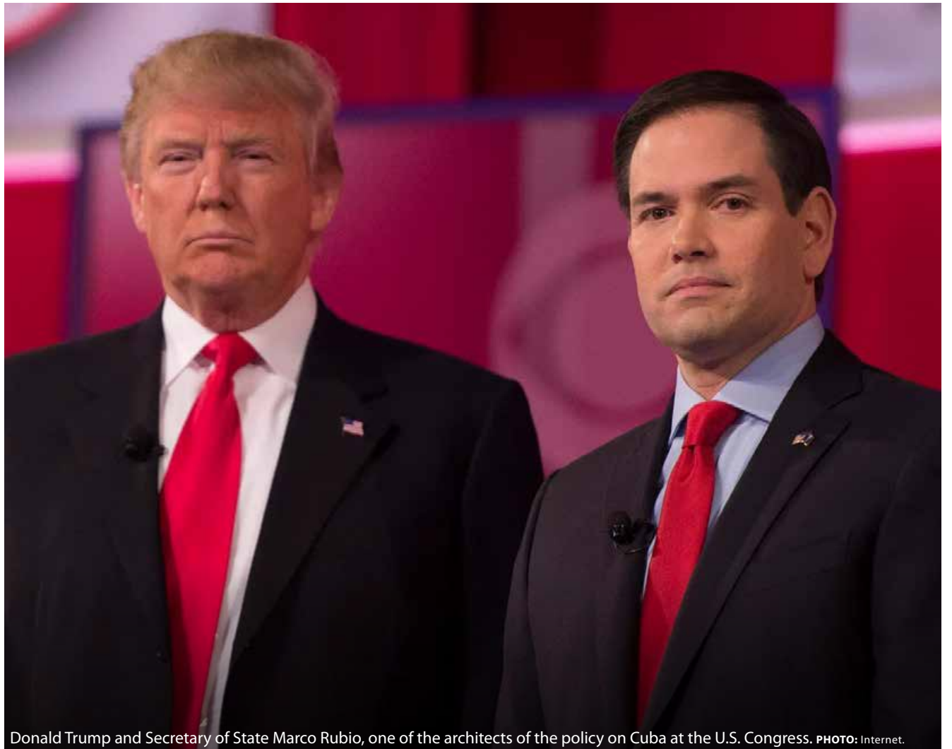
Donald Trump and Secretary of State Marco Rubio, one of the architects of the policy on Cuba at the U.S. Congress.

The head of the U.S. diplomacy not only reinstated in that list entities that were already sanctioned, but included one more: Orbit S.A., a channel for the sending of remittances to the Caribbean island.