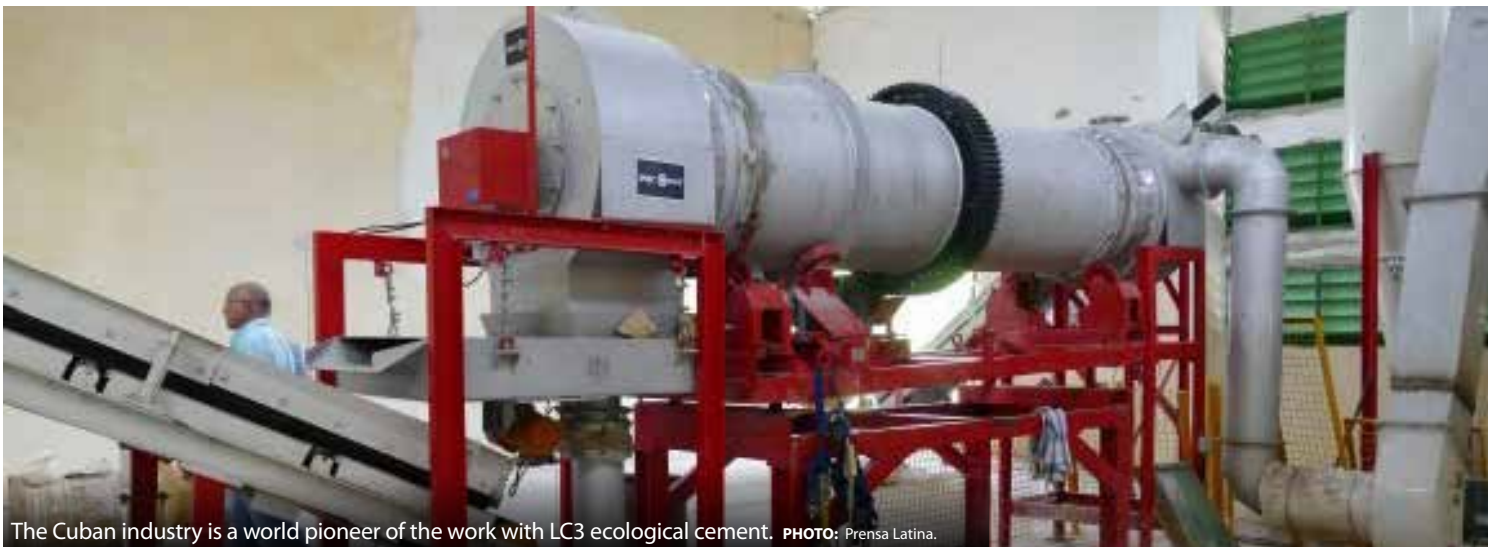
The Cuban industry is a world pioneer of the work with LC3 ecological cement.