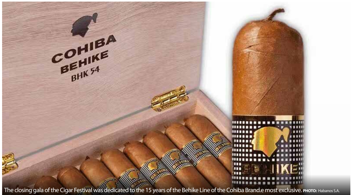
The closing gala of the Cigar Festival was dedicated to the 15 years of the Behike Line of the Cohiba Brand, the most exclusive.

Such leaves, known as medio tiempo (half time) or Fortaleza 4 (strength 4), are extremely rare as they only come from the top part of the tobacco plant cultivated under the sunlight, which gives an additional value to this already exclusive product.