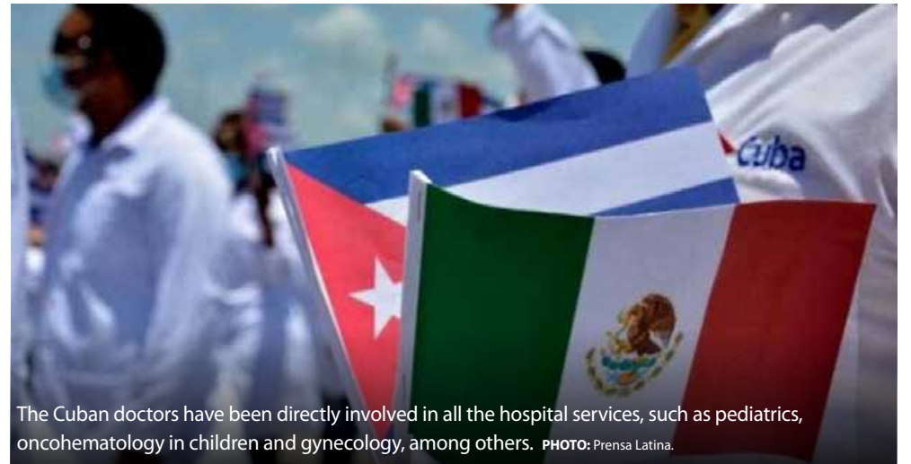
The Cuban doctors have been directly involved in all the hospital services, such as pediatrics, oncohematology in children and gynecology, among others.