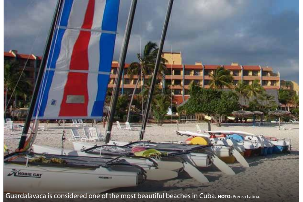
Guardalavaca is considered one of the most beautiful beaches in Cuba.

only enjoying the abovementioned beach and city modalities but also the nature, adventure and rural tourism.