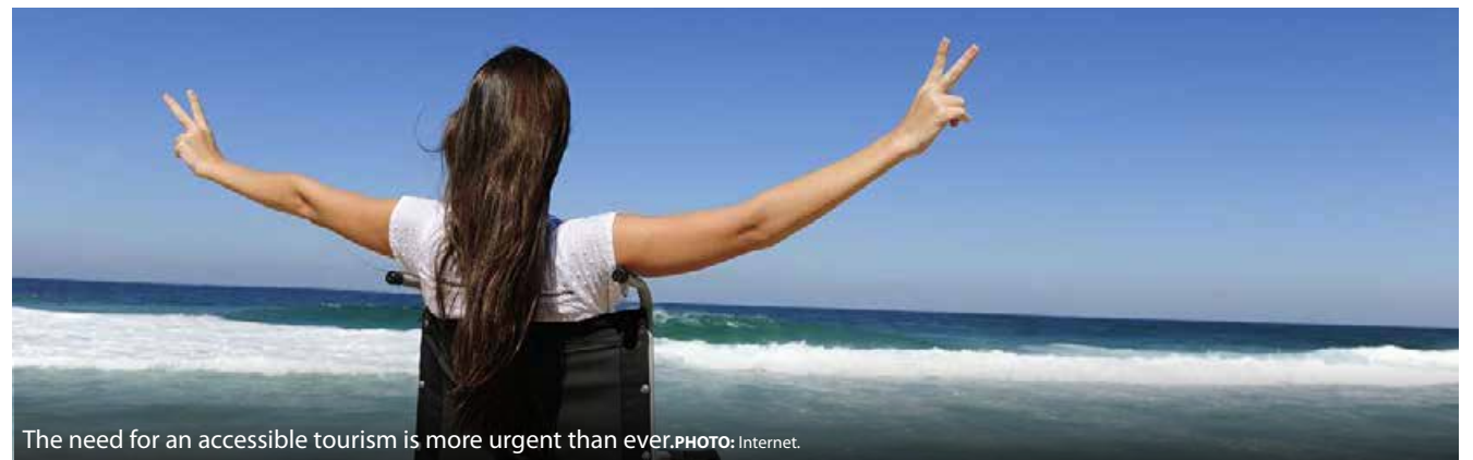
The need for an accessible tourism is more urgent than ever.

Perelló made reference to different types of limited accessibility to this form of travels, such architectonic and urban designs, transportation systems, communication and web.