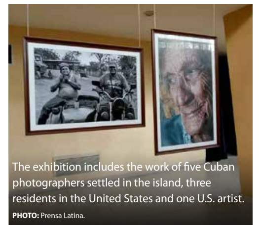
The exhibition includes the work of five Cuban photographers settled in the island, three residents in the United States and one U.S. artist.

At the walls of the Covarrubias lobby, spectators can see stories that go from intimate portraits that explore family